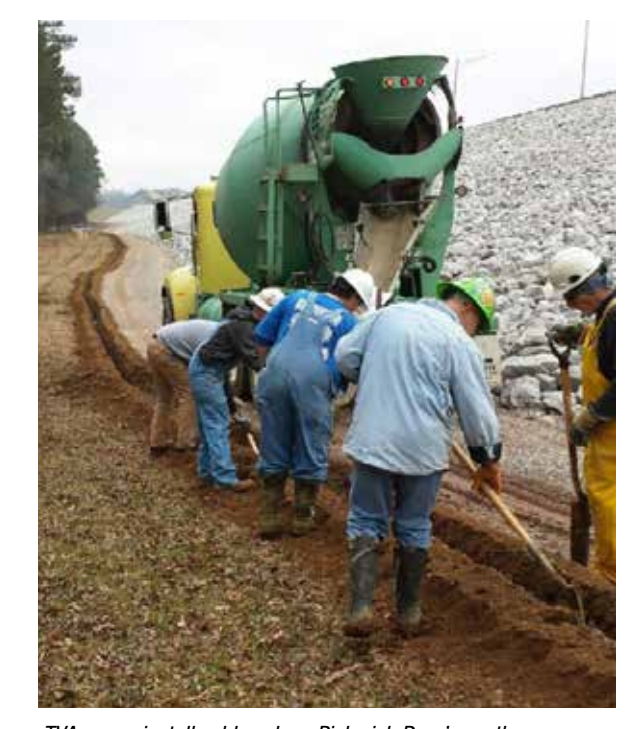
TVA crews install cables along Pickwick Dam's south embankment to detect even slight movement.